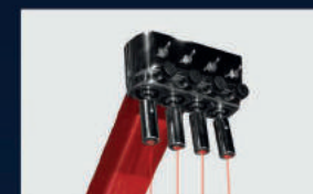
Laser alignment system standard - new feature for 2020