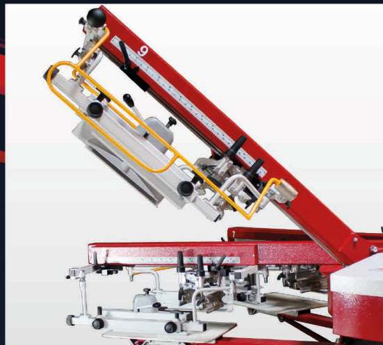
Heads Up Feature