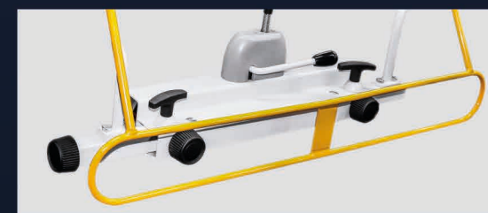
Industry-leading safety bars ensure safe set-up and operation