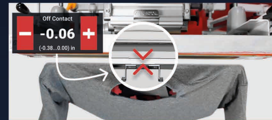
Digital off-contact adjustment right from the touchscreen control panel