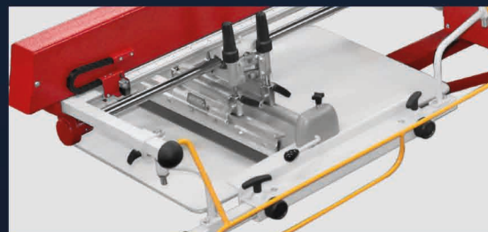
AC-electric print heads