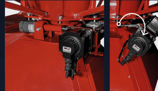
High quality servo indexer for smooth, quiet rotation at even the highest production speeds, as well as free-wheel capability for manual rotation