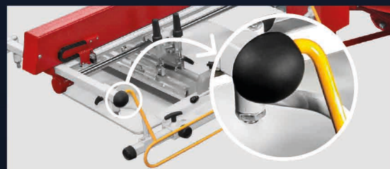
Smash button helps prevent misprints