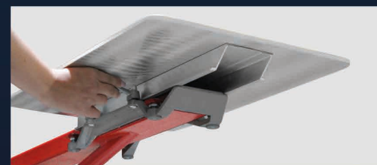
Slide-style pallet system for easy adjustment and changeover