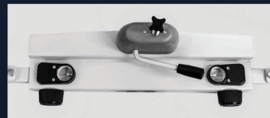
Easy-to-read micro-registration targets with lenses for protection and magnification (NEW FEATURE)